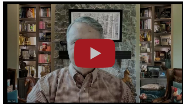
Elite Remodeling Business Update - May 2022

To get in the mood, read on and discover a few fine tips for turning this space into a dazzling paradise.