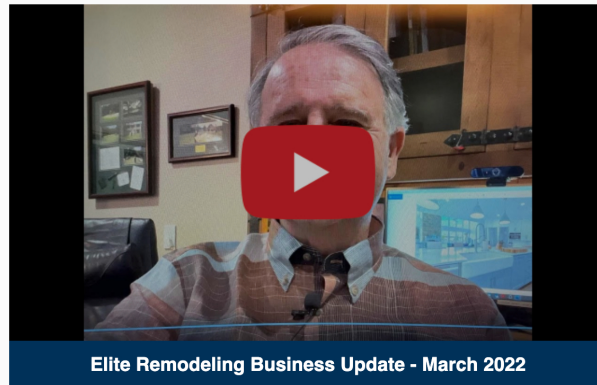
Elite Remodeling Business Update - March 2022

Learn how to navigate open floor plans, whether you're planning a large-scale renovation or hoping to enhance a sense of communication and togetherness in your home.