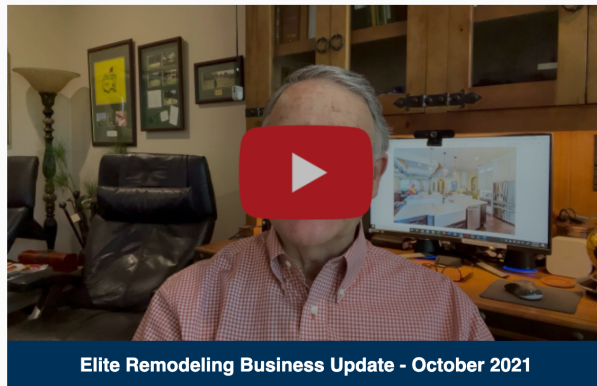
Elite Remodeling Business Update - October 2021

Today, we'll look at 8 of the most appealing color trends for Fall and Winter of 2021 and 2022, and discuss how they can be used to bring warmth into your interior decor.